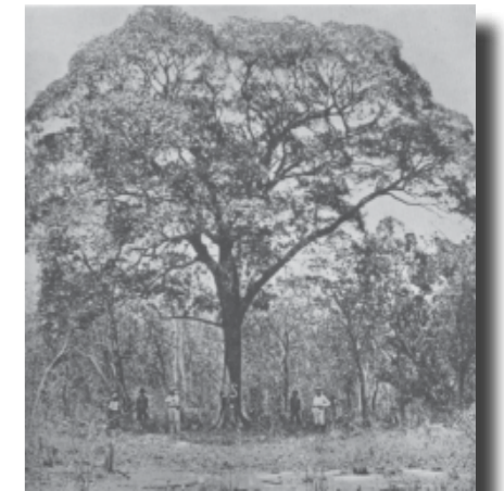
Aboriginal and non-Aboriginal people beneath Stuart's Tree carved with large 2 ft (61 cm) initials. Photo Paul Foelsche 1885.

In 1971 the Reserves Board of the NT placed a memorial cairn where the tree once stood, which is still in place today.