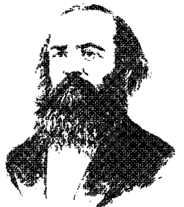
John McDouall Stuart 1815 - 1866

Stuart knew of their success and death before he set out in October 1861 for his last successful attempt.