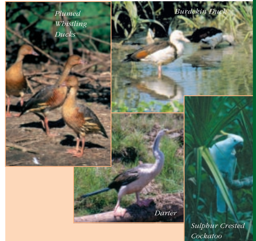
Plumed Whistling Ducks

Burdekin Ducks ( Tadorna radjab ) are most common in the Dry when the habitat is more suitable for them to feed. They sieve through the mud at the water's edge searching for small aquatic insects and dabble at the surface while diving.