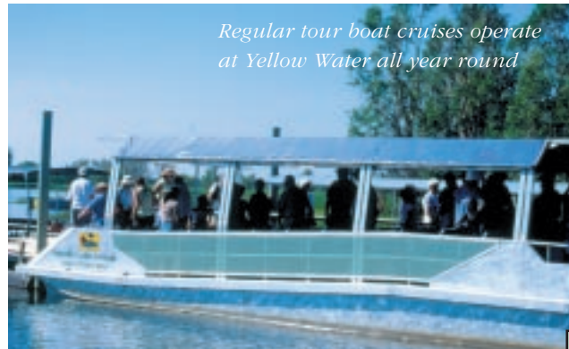
Regular tour boat cruises operate at Yellow Water all year round

The Yellow Water wetlands attract about 120 000 tourists each year. They are also used by park residents and visitors for recreational fishing. The information collected by the tour operators and eriss personnel has been used to increase the awareness of visitors of the importance of wetlands in general and Yellow Water in particular. This joint effort has also resulted in a better understanding of the seasonal cycles that occur at Yellow Water.