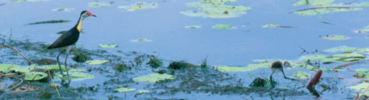
Jacana and chick

The Comb Crested Jacana ( Irediparra gallinacea ) also known as Lotus Bird or Jesus Bird is an 'emblem' of tropical and subtropical freshwater swamps and lagoons. They occur all year round at Yellow Water and breed from February to March. They build their nests on floating platforms made from the leaves of aquatic plants. Jacanas have long thin legs and elongated toes suitable for wading and walking over the 'surface' of the water. These toes seem out of proportion to their relatively small bodies and give them a comical appearance. Nevertheless, they have a nice balance between height and weight distribution that is suitable for walking on floating vegetation such as waterlilies. They feed mainly on insects and seeds from aquatic plants. Their nests and juvenile can be observed from the beginning of March to April.