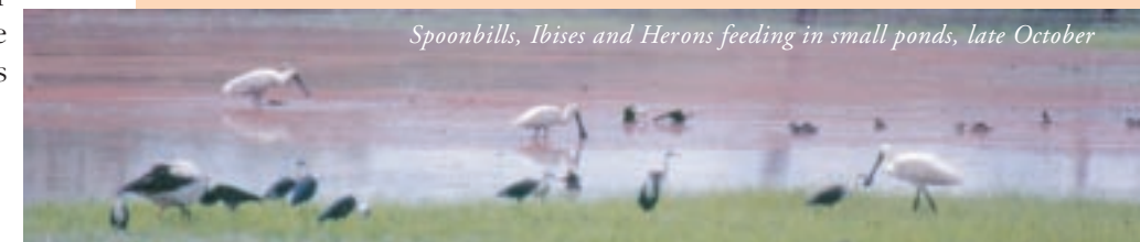
Spoonbills, Ibises and Herons feeding in small ponds, late October

Darters ( Anbinga melanogaster ) are sedentary and can be observed all year round at Yellow Water. They spend most of the day resting on exposed perches, sunning, preening and digesting their food. They are usually colonial and nest in trees close to the water. They breed during the Wet and the chicks can be seen in the nests until July.