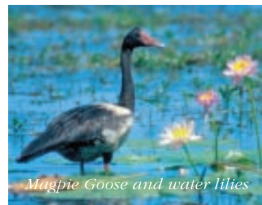
Magpie Goose and water lilies

The White Bellied Sea Eagle ( Haliaeetus leucogaster ) is one of the best known resident birds at Yellow Water and can be observed all year round. These majestic birds build their large nests in the top of tall trees. They are carnivorous and hunt other birds, reptiles and fish. They can be observed perching on