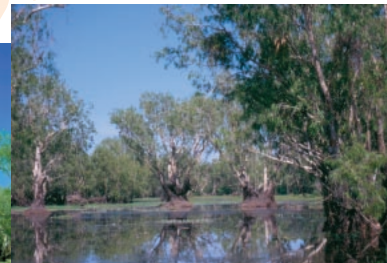
Changes in water levels in the paperbark swamps at Yellow Water during the early and late Dry season