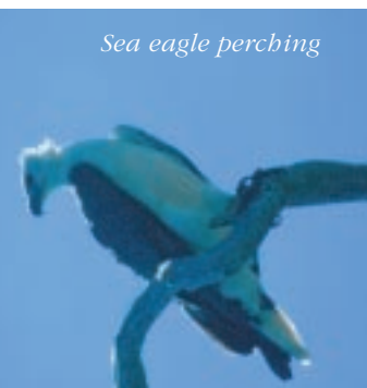
Sea eagle perching